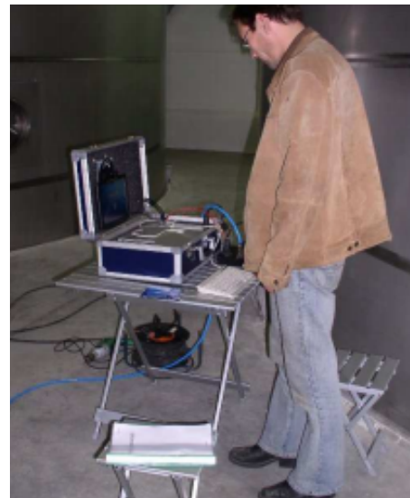
Inspection on a color display