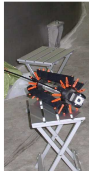
Camera ready for use